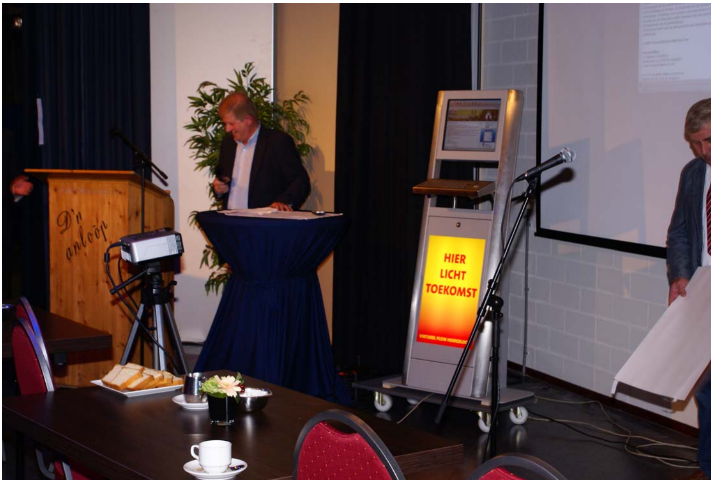
Hoogeloon: Here lights future