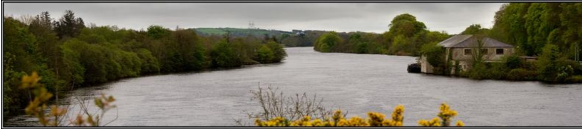
Lough Derg

The focus of the Lough Derg Marketing Committee is to market the Lake's tourism potential in a coordinated and focused manner. The Committee comprises representatives from the Regional Authority, Limerick, Clare, North Tipperary and Galway County Councils, Limerick City Council, Shannon Development, Waterways Ireland and Fáilte Ireland. The objectives of the Committee are to bring a coherent marketing focus to the Lough Derg catchment area and to establish the ' Lough Derg Brand ' nationally and internationally.