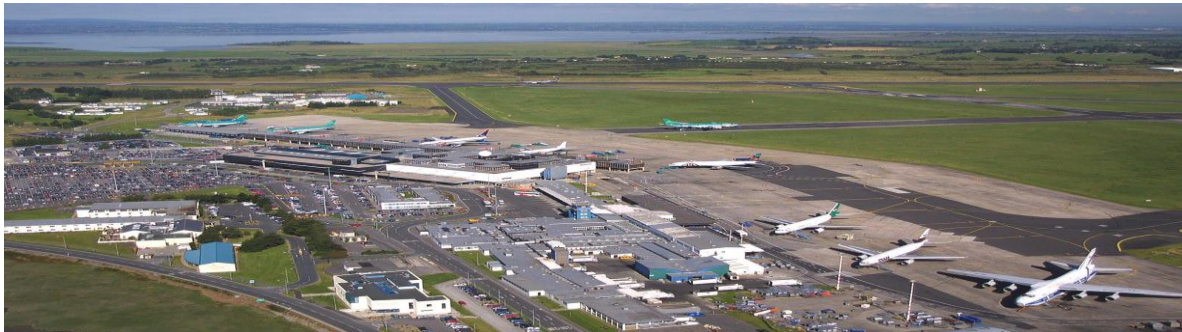
Shannon International Airport

The Regional Authority provides the Secretariat to the Minister for Transport appointed Committee which is comprised of members from the Local Authorities and other public agencies, together with the regional tourism interests such as hoteliers, travel agents (see below). The Committee provides a coordination and advisory forum for the marketing of Shannon Airport. The Committee also provides research and expert advice on a range of areas critical to the Airport's marketing and strategic planning, i.e. transport and access, route development, tourism product development, product marketing and communications with regional stakeholders. The Committee informs the preparation of the various tourism and transportation policies and plans in the Mid-West Region. Post Open Skies, the Committee works with the Shannon Airport Authority to promote the Airport to airlines and the travelling public. In conjunction with the SAA the promotion of the Airport's US Customs and Border Protection facility is a focus of the Committee in particular the provision of CBP clearance for Cargo freight.