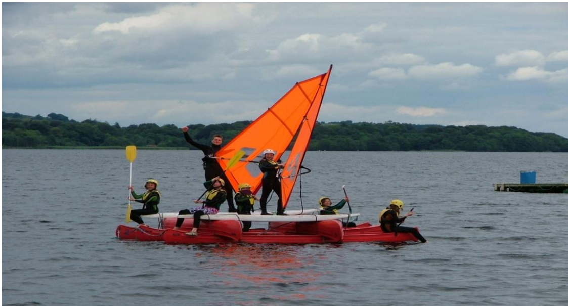
Water Sports on Lough Derg