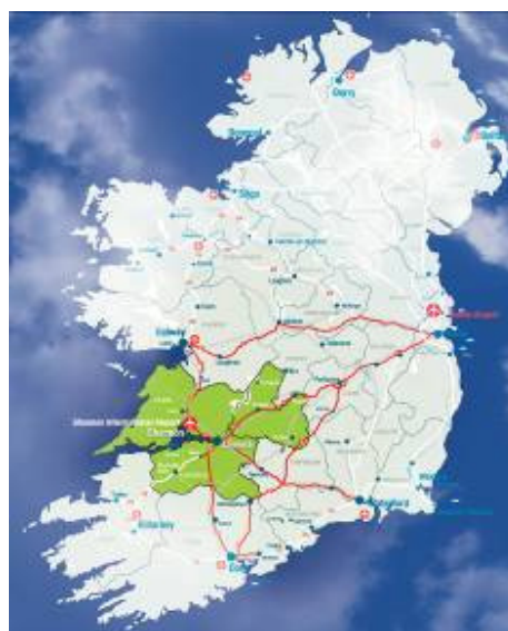
Figure 1: Mid-West Region, Ireland

The Mid-West Region of Clare, Limerick and North Tipperary is one of eight statutory regions comprising of about 10% of the national land area and population of the country. The Region faces the Atlantic Sea Board with considerable maritime influences; the Shannon passes through the Mid-West forming a distinctive corridor and unifying force in the character of the area. Much of the rural areas are grown in pasturelands with uplands particularly around the fringes of the Region. The whole of the region is covered for economic and tourism development purposes by Shannon Development whose remit also covers South Offaly and North-Kerry. Figure 1 illustrates the location and geographical area of the Mid-West region.