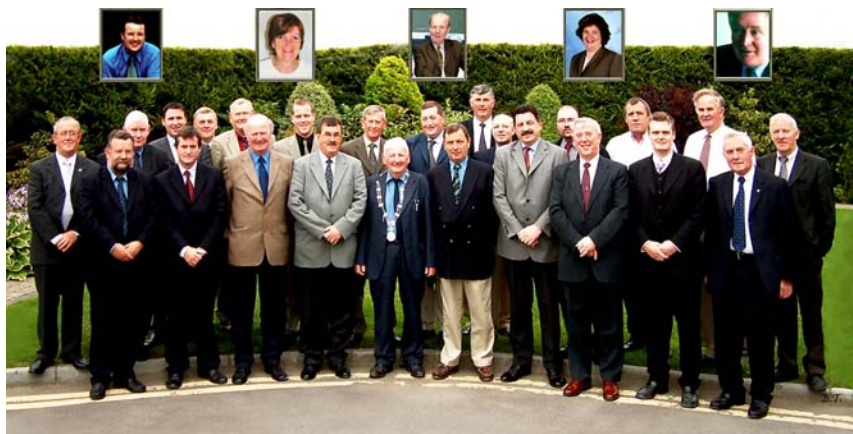
Newly Elected Regional Authority, AGM, 26 th July 2004

The following held office as members of the Mid West Regional Authority at the beginning of the five-year term 2004-2009: