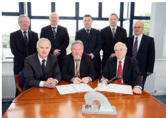
Signing of MWASP Contract – May 2009

The Senior Planners in the region meet under the auspices of the Mid West Regional Authority. The Group makes submissions on relevant government policy circulars and guidelines and raises issues of regional trans local authority boundary importance for the Mid West region.