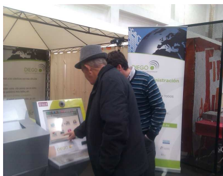
DIEGO Dissemination at Quart de Poblet Christmas Fair, December 2010