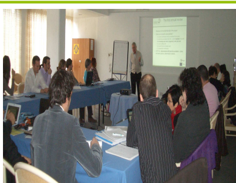
DIEGO Project Partners gathered in Paphos,